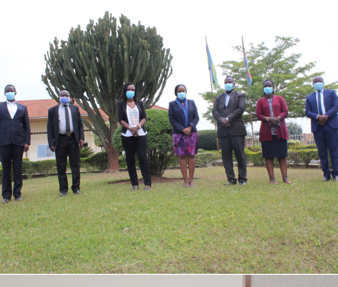
MAYOR MUHANGA DISTRICT